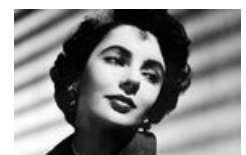
Elizabeth Taylor 1932 - 2011